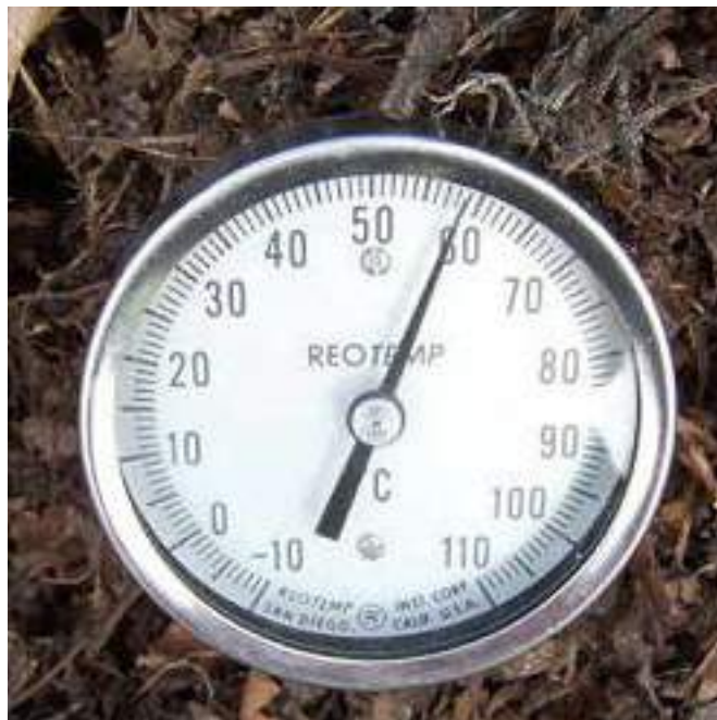
Compost piles of manure and other organic matter that reach 60 degrees C will kill many weed seeds.