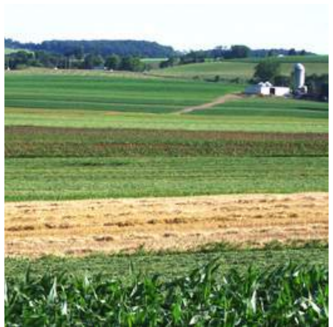
Rotating a perennial sod crop (such as alfalfa) with small grains and corn varies seasonal periods, rooting depth, nutrient cycling and biomass contribution—all elements of a successful rotation to suppress weeds in the mini-pumpkin strip in this mixture (young plants, center).

Sample strategy: follow a high-nutrient-demanding, shallow-rooted vegetable crop such as lettuce or spinach with a deeper-rooted crop or cover crop that can utilize the available nutrients left in the soil.