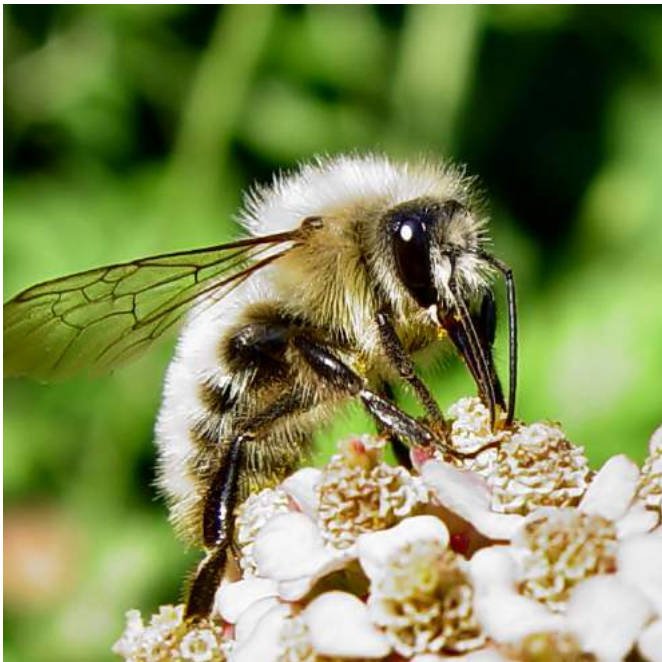
This bee, Osmia ribifloris (on a barberry flower), is an effective pollinator of commercial blueberries.

Many members of the Umbelliferae (coriander, dill, Queen Anne’s lace), Compositae (goldenrod, yarrow, sunflower), Brassicaceae (sweet alyssum, wild mustard), and Leguminosae