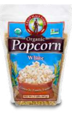
Grain Place Foods Popcorn