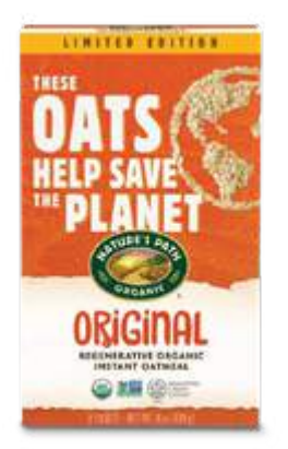
Nature's Path Regenerative Organic Oatmeal