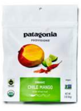
Patagonia Provisions Chile Mango