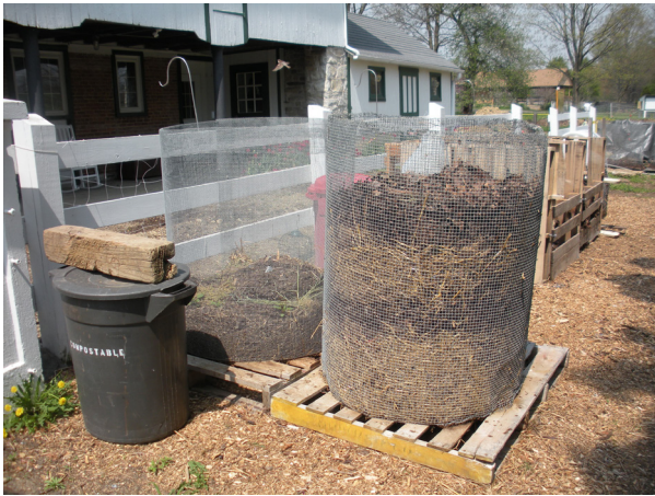
Increase air flow and drainage by elevating your bin on a pallet

When choosing a bin, keep volume in mind. We recommend something 3x3x3 feet or larger. This will minimize the surface-to-volume ratio and improve heat retention during composting.