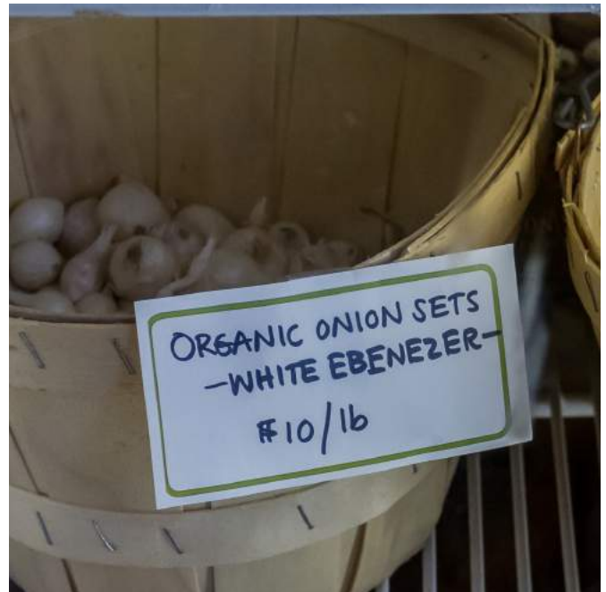
Picture of pricing on an organic product on shelf

A pricing plan allows you to recapture your production costs and calculate profit or loss. It can help you determine accurate production costs for each of your products, set selling prices that cover your costs and make you a profit, convince your customers to pay that price, expand your customer base, and increase your peace of mind. Collecting the information you need to formulate a fair product price can be a little time consuming. But the records you create the first time around can be used over and over again with a little updating along the way.